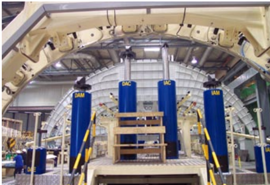
AIRBUS A380 Positioners from the AIT upper shell tool for the A380.